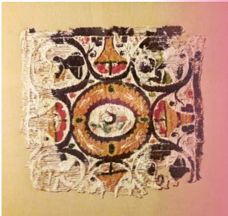
Sl. 5. – Fragment koptske tkanine, izložba Koptski tekstil iz zbirke Narodnog muzeja Slovenije, Narodni muzej Slovenije, 10. 10. 2019.–21. 6. 2020. / Fig. 5 – Fragments of Coptic Textile, Exhibition Coptic Textiles from the Collection of the National Museum of Slovenia, National Museum of Slovenia, 10. 10. 2019.–21. 6. 2020.