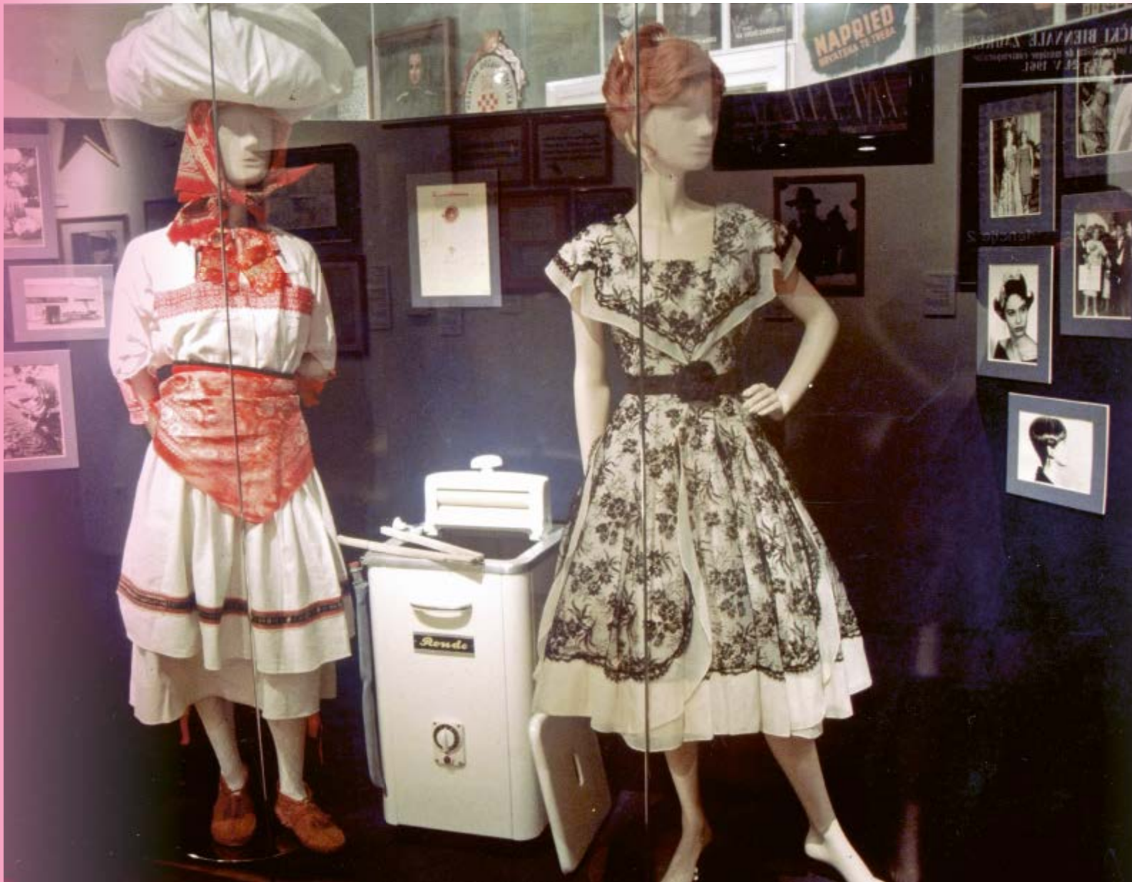
Sl. 1. – Dio stalnog postava, Muzej grada Zagreba, Hrvatska. / Fig. 1. – Part of the permanent exhibition in the Zagreb City Museum, Croatia.