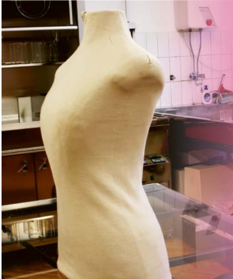
Sl. 3. – Prilagođavanje klasičnih krojačkih lutaka odjeći (tzv. costume mounting ) u Muzeju za umjetnost i obrt, Zagreb, Hrvatska (prije prilagodbe) / Fig. 3 – An example of the costume mounting , Museum of Arts and Crafts, Zagreb, Croatia (before adjustment)