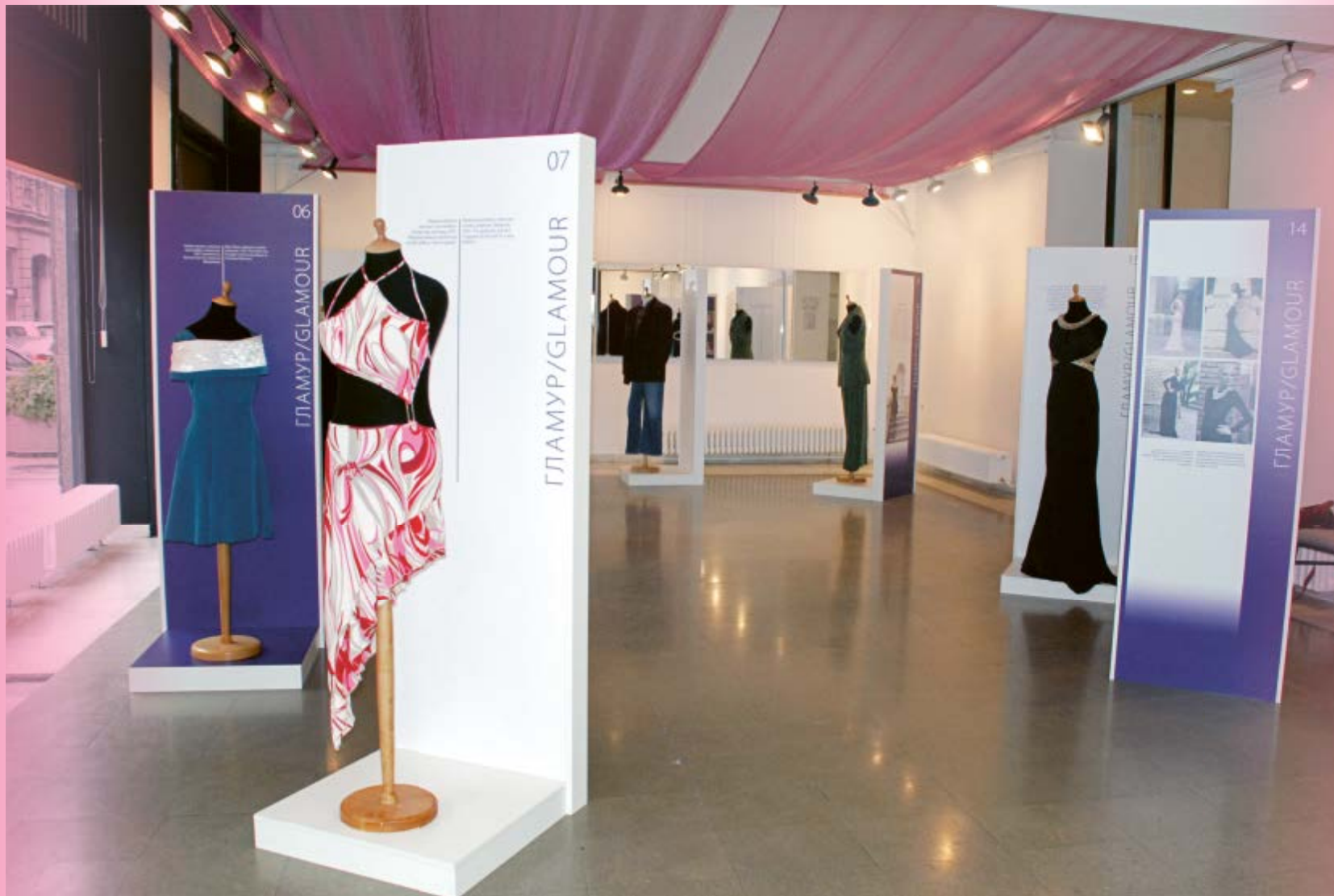
Sl. 3. – Izložba „Glamur na „srpski način“: maturski balovi (1991-2014)“, Grupa autora, Etnografski muzej u Beogradu, 2014. (Etnografski muzej u Beogradu) / Fig. 3. – Exhibition “Glamour in the “Serbian way“: prom dance events (1991-2014)”, Group of authors, Ethnographic Museum in Belgrade, 2014. (The Ethnographic Museum in Belgrade).