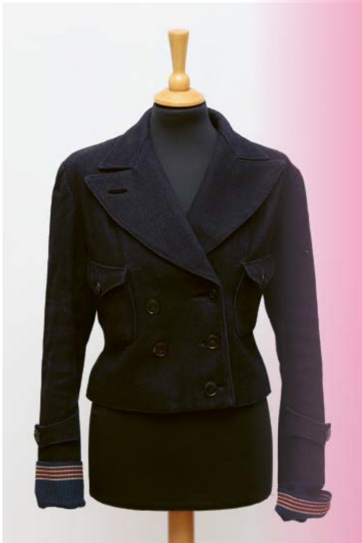
Sl. 2. – Gornji dio ski-odijela Tivar d. d. (prednja strana), kraj 1936. / Fig. 2 – The upper part of the ski suit (front size), made by Tivar d. d., cca 1936.