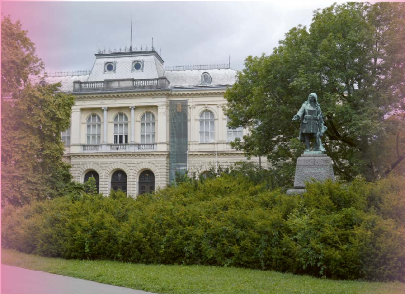
Sl. 1. – Narodni muzej u Sloveniji. (Fotografija Marko Mahnič) / Fig. 1 – National Museum of Slovenia. (Photo by Marko Mahnič)