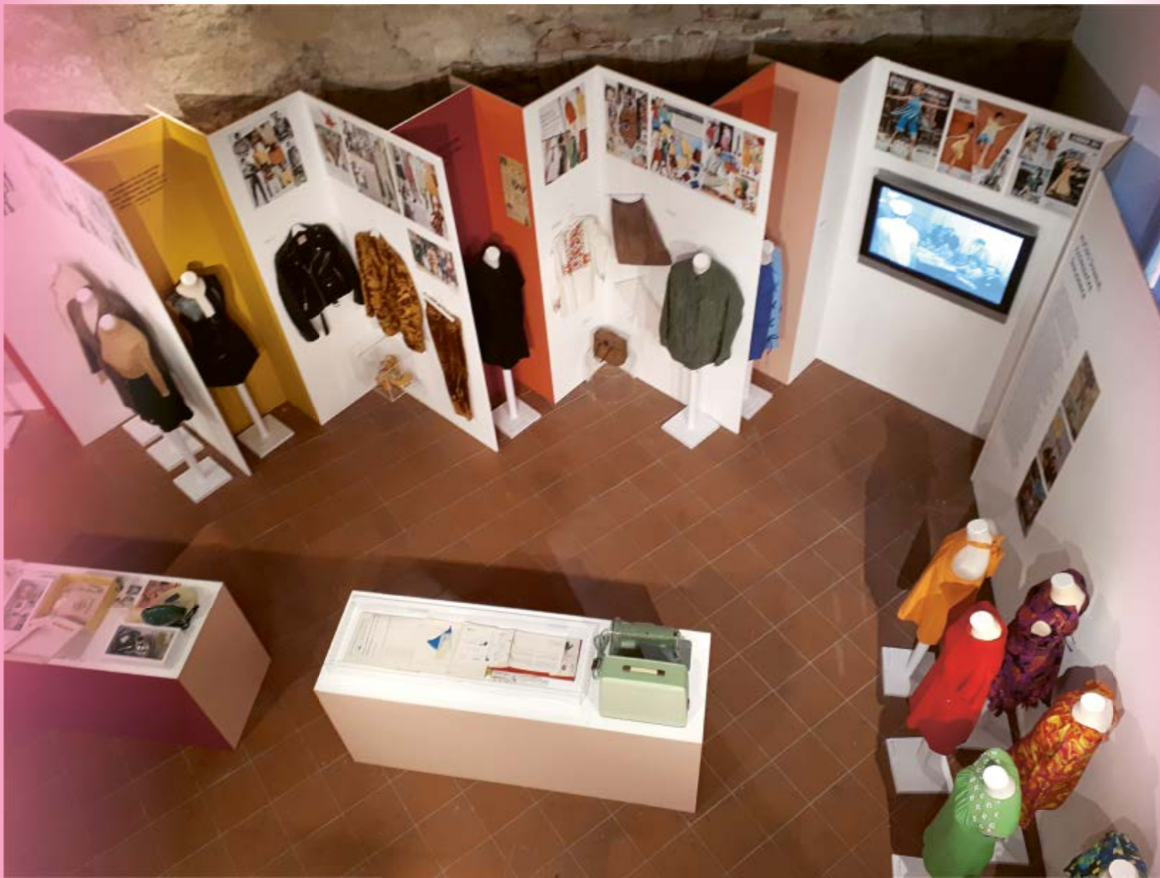
Sl. 4. – Dio postava izložbe Moda i odijevanje u Zagrebu 1960-ih , Muzej grada Zagreba, 2019. / Fig. 4. – Part of the exhibition Fashion and clothing in the 1960s Zagreb , Zagreb City Museum, 2019.