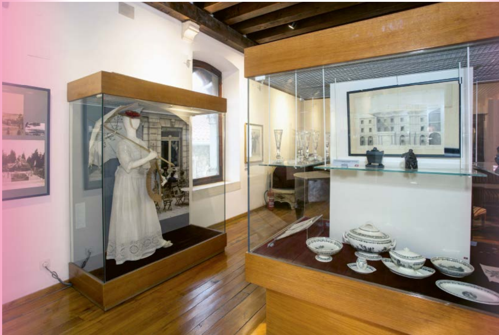
Sl. 1. – Vitrina s izloženom haljinom u stalnom postavu Muzeja grada Splita, 2020. / Fig. 1. – A display case with a dress, permanent display of the Split City Museum, 2020.