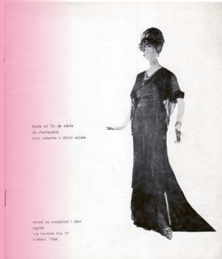
Sl. 2. – Katalog izložbe Oblici odjeće Muzeja za umjetnost i obrt održane 1952. godine u Zagrebu i 1955. u Beogradu. / Fig. 2 – The catalogue Fashion from the fin de siècle to Charleston (orig. Moda od fin de siècle do charlestona ) of exhibition organized by the Museum of Arts and Crafts in Zagreb (1966)