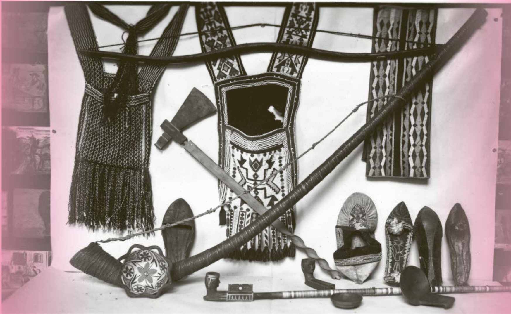
Sl. 3. – Snimak dijela izložbe etnografske zbirke iz Afrike, Amerije i Azije (1957). / Fig. 3 – A snapshot from the Exhibition The Museum Week: the Exhibitions of the Ethnographic Collections from Africa, America and Asia (1957).