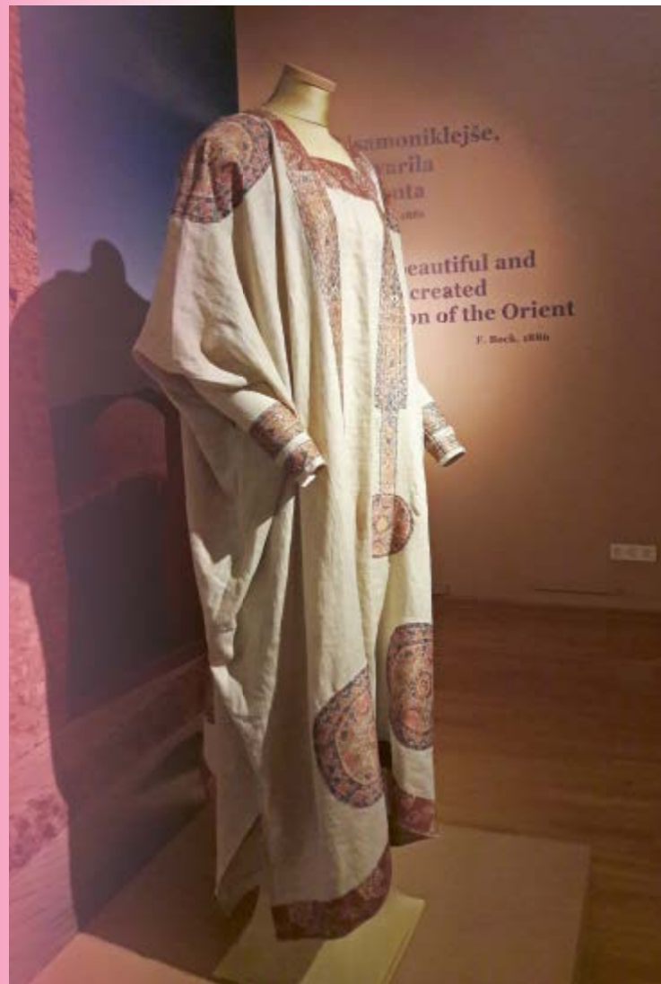
Sl. 6. – Rekonstrukcija tunike i koptskih motiva, izložba Koptski tekstil iz zbirke Narodnog muzeja Slovenije, Narodni muzej Slovenije, 10. 10. 2019.–21. 6. 2020. / Fig. 6 – Reconstruction of a Tunic adorned with Coptic Motifs, Exhibition Coptic Textiles from the Collection of the National Museum of Slovenia, National Museum of Slovenia, 10.10.2019.–21. 6. 2020.