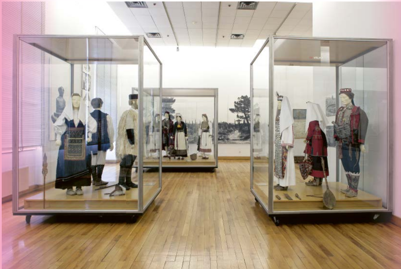
Sl. 1. – Prikaz narodnih nošnji dinarske kulturne zone, postav iz 1972. / Fig. 1. – Presentation