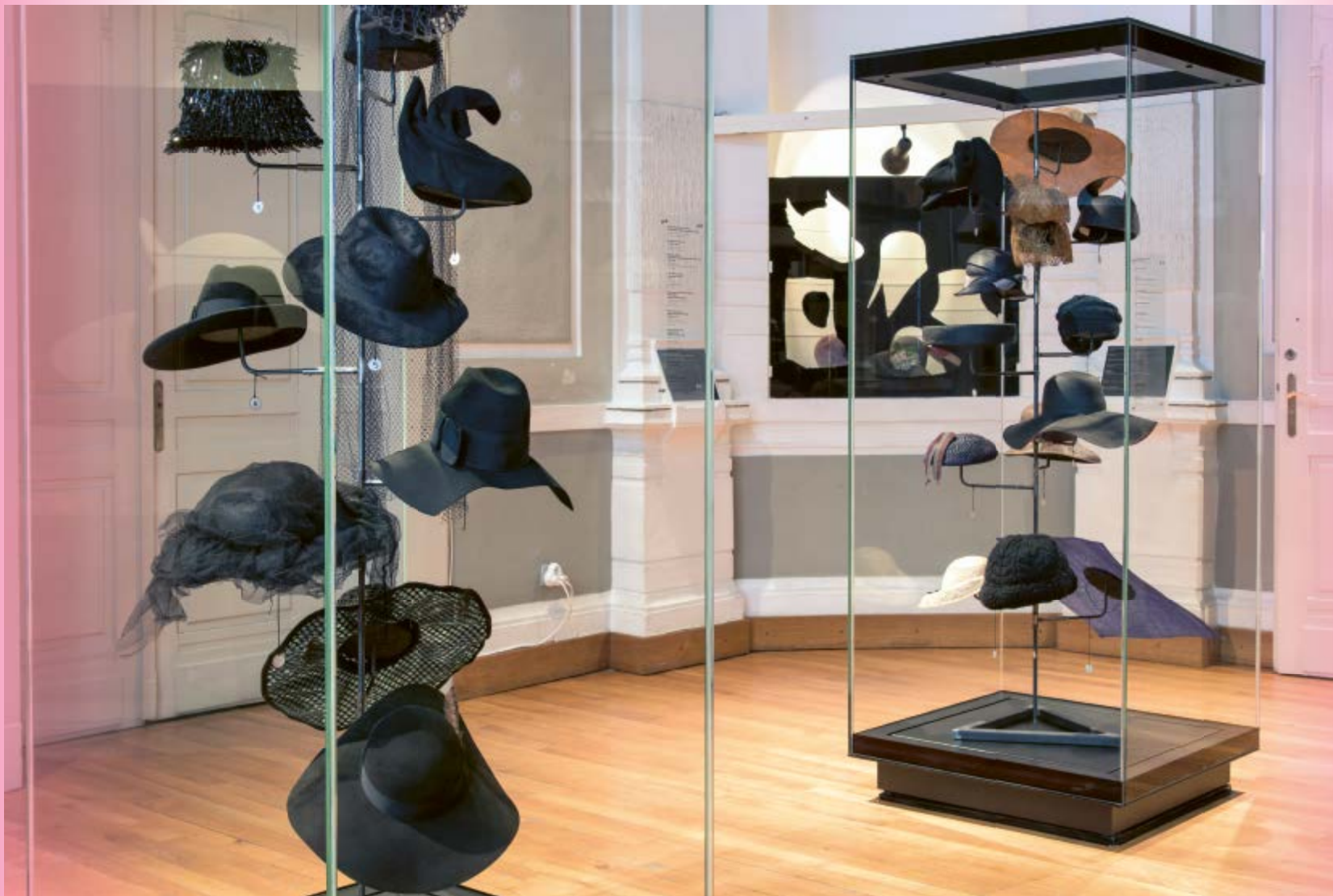
Sl. 3. – Dio izložbe „Memories Are Made Of This – Šeširi iz privatne kolekcije Đurđe Tedeschi“, 2019. (EMZ, fotografija Nina Koydl) / Fig. 3. – Part of the exhibition “Memories Are Made Of This – Đurđa Tedeschi’s private collection of hats”, 2019, Ethnographic Museum in Zagreb. (Photo by Nina Koydl)