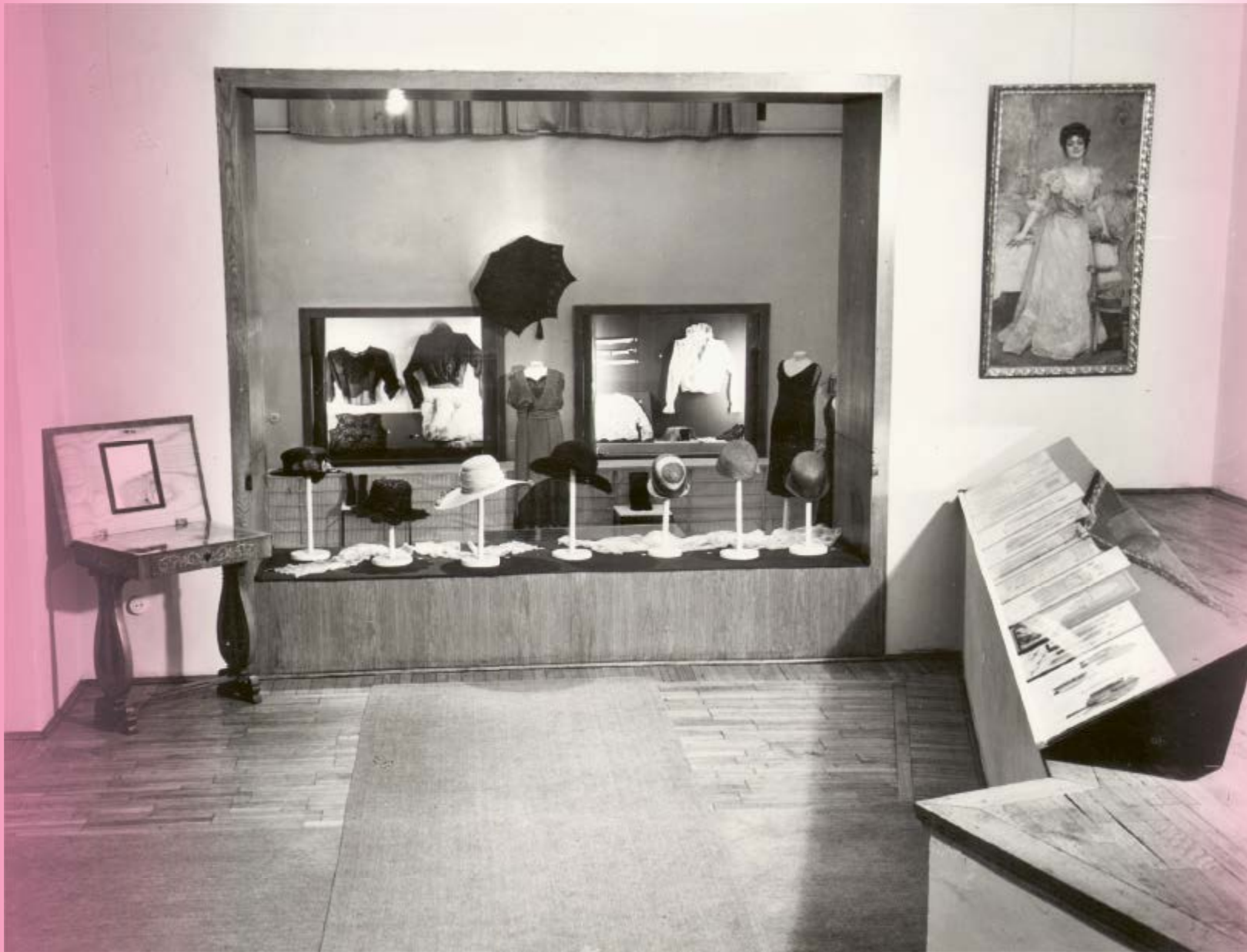
Sl. 1. – Izložba Ženska moda od sredine XIX do tridesetih godina XX veka, Muzej primenjene umetnosti, Beograd, 1966–1967. / Fig. 1 – Exhibition Women's fashion from the mid-19th century until the 1930s, Museum of Applied Art, Belgrade, 1966–1967.