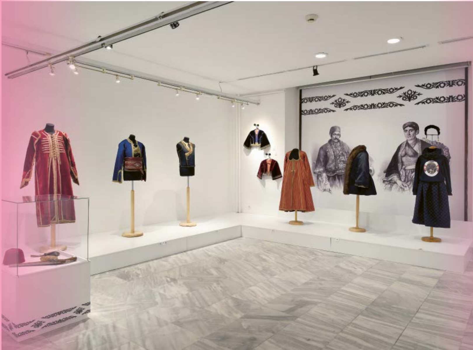
Sl. 3. – Izložba Moda u modernoj Srbiji , Muzej primenjene umetnosti, Beograd, 2019–2020. (Muzej primenjene umetnosti, Beograd, fotografija Veselin Milunović) / Fig. 3 – Exhibition Fashion in modern Serbia , Museum of Applied Art, Belgrade, 2019–2020. (Museum of Applied Art, Belgrade, photo by Veselin Milunović)