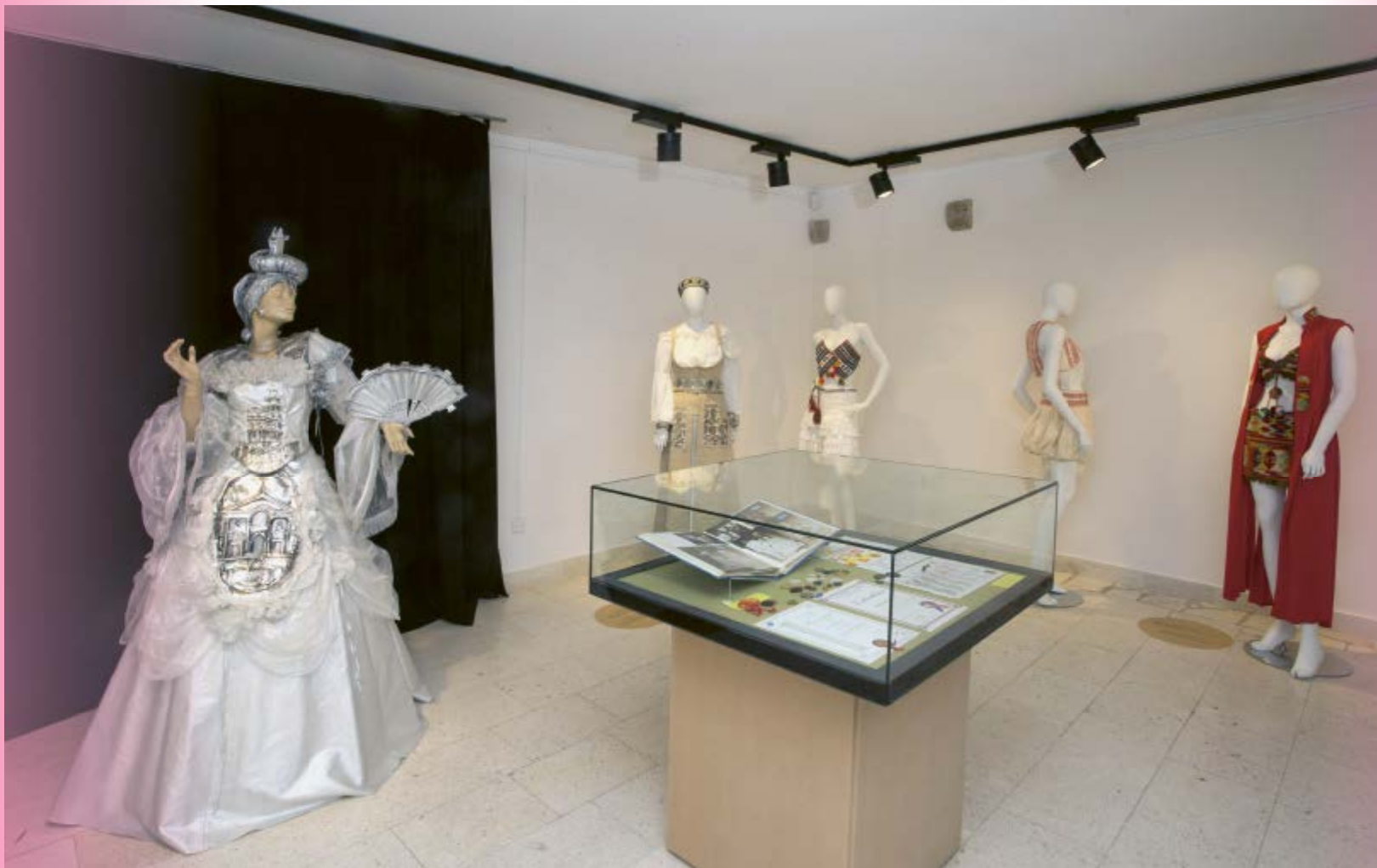
Sl. 3. – Postav izložbe Nostalgijska u novom ruhu, 2020. (Fotografija Zlatko Sunko) / Fig. 3. – Exhibiton New Garments of Nostalgijska, 2020. (Photo by Zlatko Sunko)