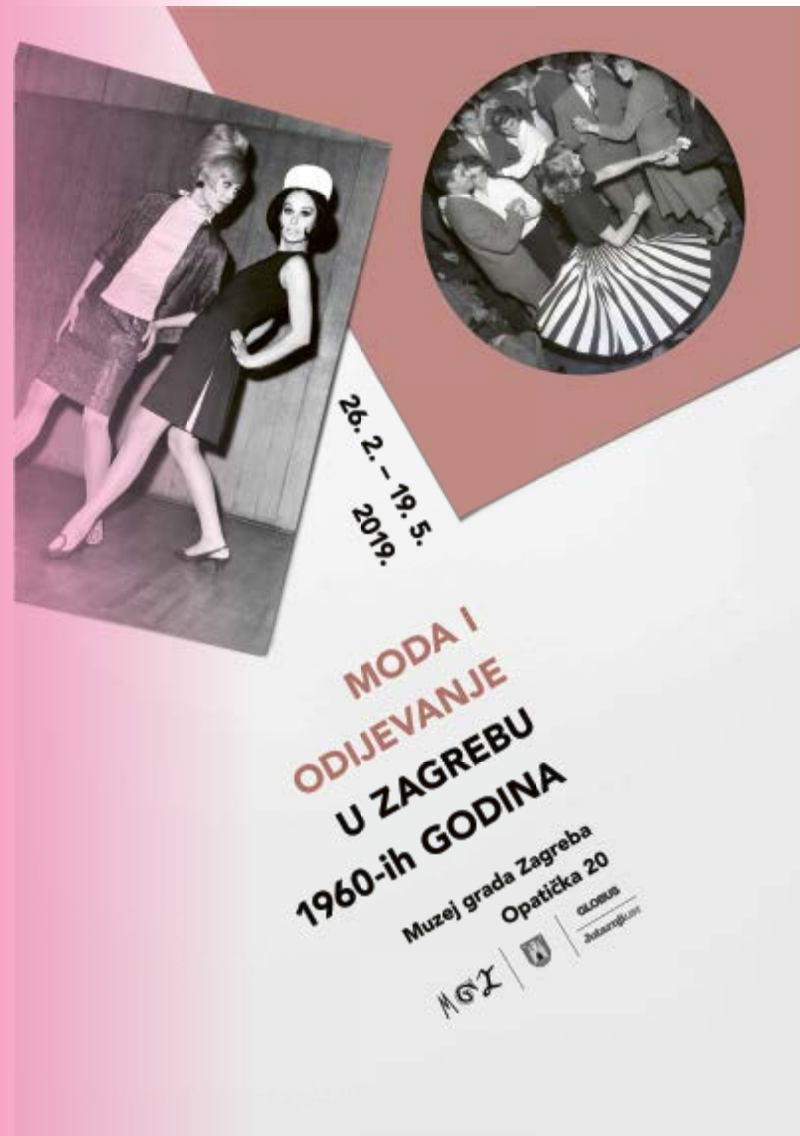
Sl. 3. – Plakat za izložbu Moda i odijevanje u Zagrebu 1960-ih , Muzej grada Zagreba, 2019. / Fig. 3 – Poster for the exhibition Fashion and clothing in the 1960s Zagreb , Zagreb City Museum, 2019.