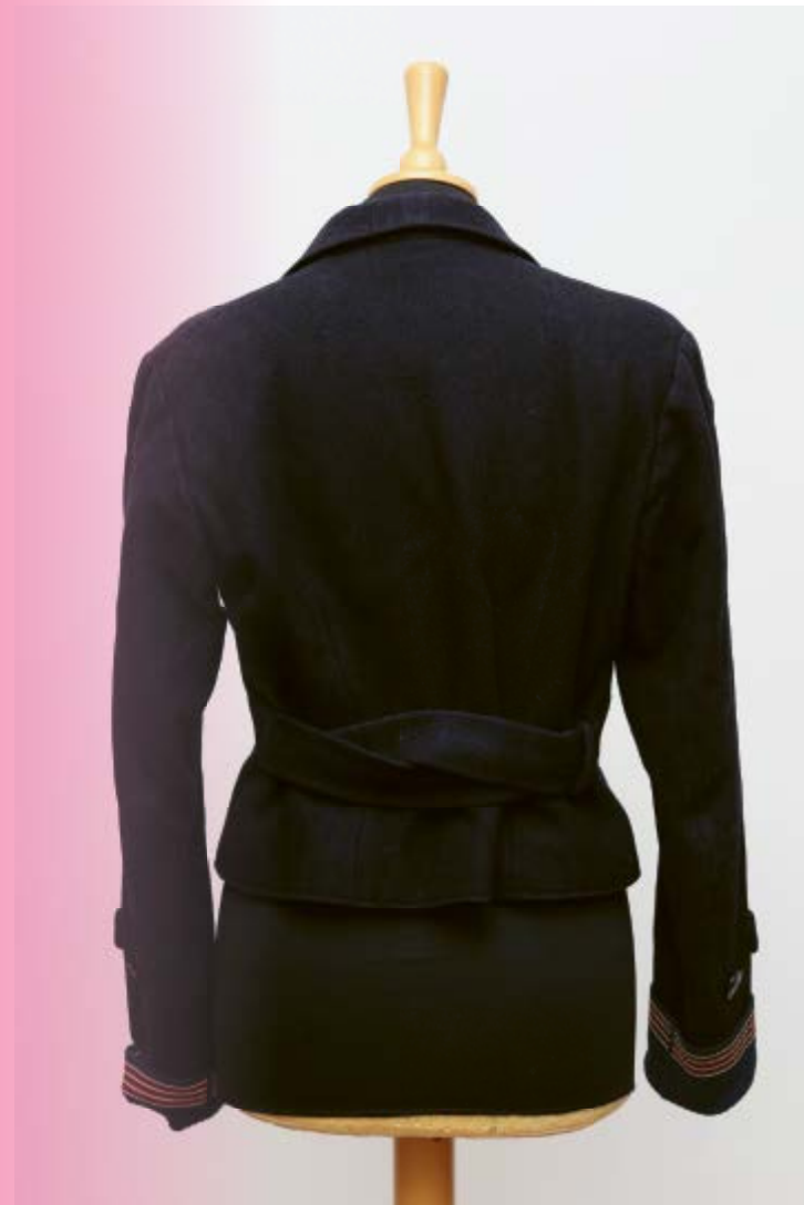
Sl. 3. – Gornji dio ski-odijela Tivar d. d. (stražnja strana), kraj 1936. / Fig. 3 – The upper part of the ski suit, made by Tivar d. d. (back side), cca 1936.