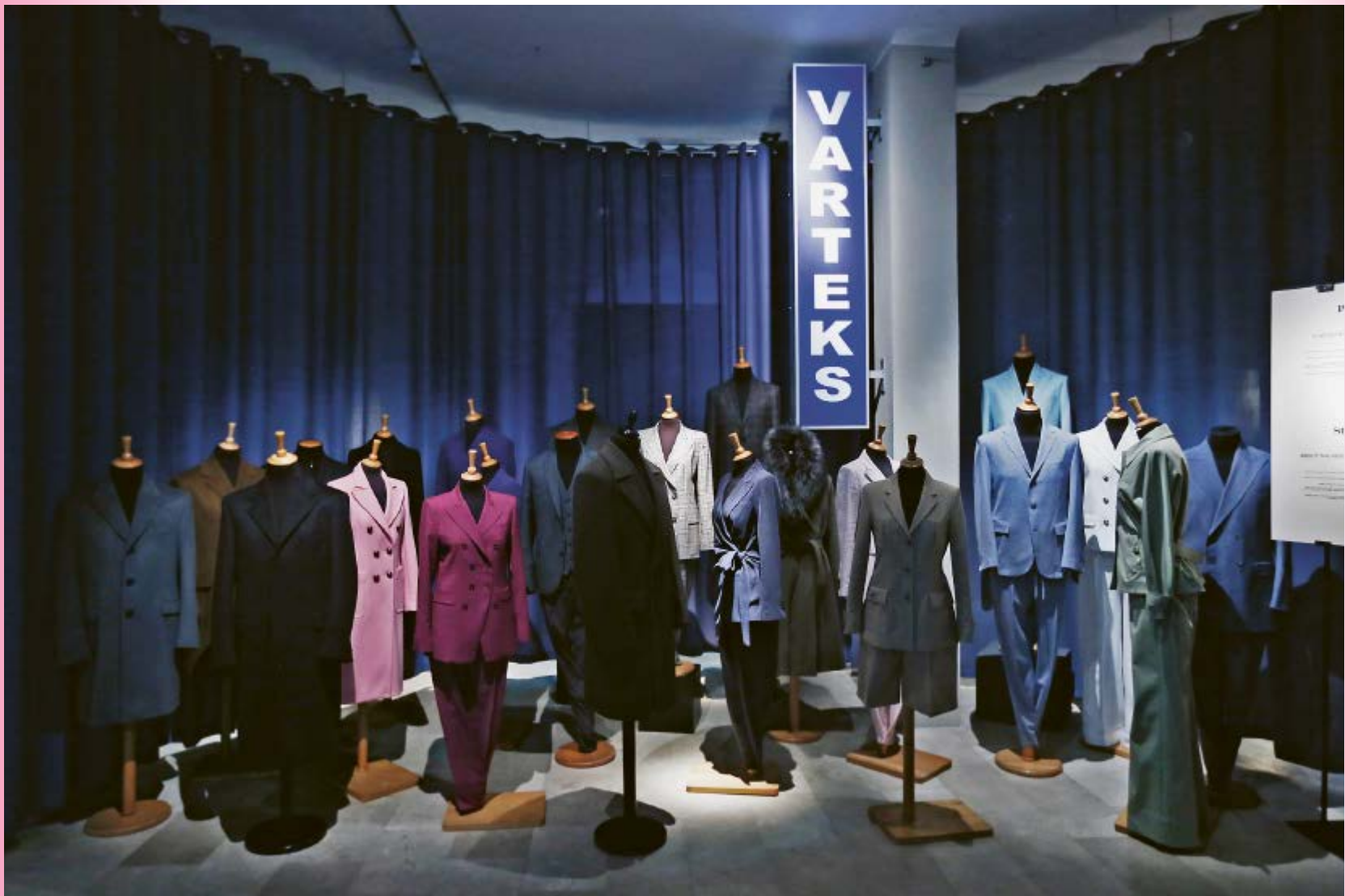
Sl. 5. – Postav izložbe Priče koje kroje Varteks u Muzeju za umjetnost i obrt Zagreb, 2019./ Fig. 5. – Tailor-made stories (Priče koje kroje Varteks) exhibition held in Museum of Arts and Crafts, Zagreb, 2019.