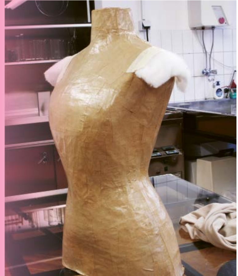
Sl. 4. – Prilagođavanje klasičnih krojačkih lutaka odjeći (tzv. costume mounting ) u Muzeju za umjetnost i obrt, Zagreb, Hrvatska (nakon prilagodbe) / Fig. 4 – An example of the costume mounting , Museum of Arts and Crafts, Zagreb, Croatia (after adjustment)