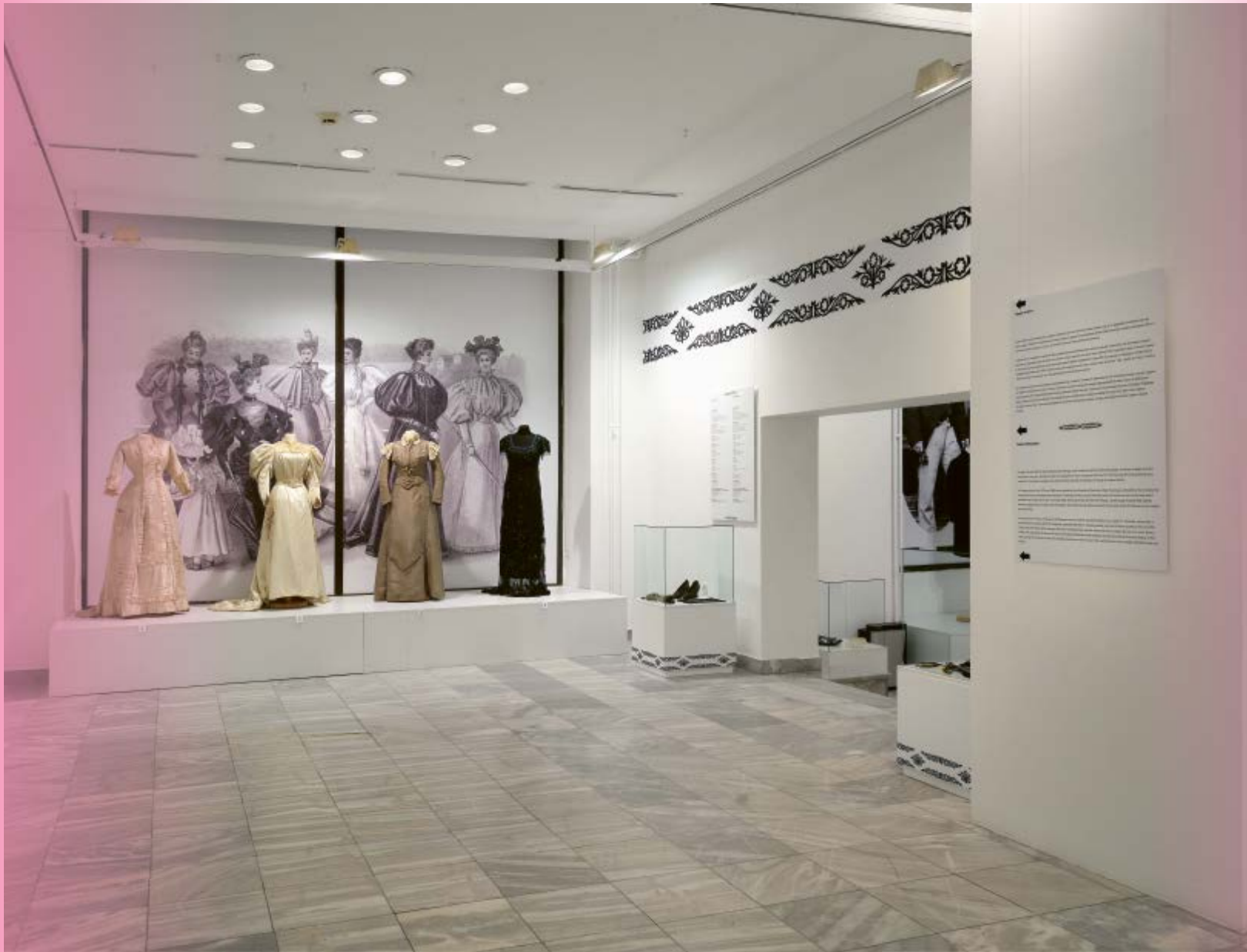
Sl. 2. – Izložba Moda u modernoj Srbiji , Muzej primenjene umetnosti, Beograd, 2019–2020. (Muzej primenjene umetnosti, Beograd, fotografija Veselin Milunović) / Fig. 2 – Exhibition Fashion in Modern Serbia: Fashion in the 19th and the early 20th centuries in the collection of the Museum of Applied Art in Belgrade , Museum of Applied Art, Belgrade, 2019–2020. (Museum of Applied Art, Belgrade, photo by Veselin Milunović)