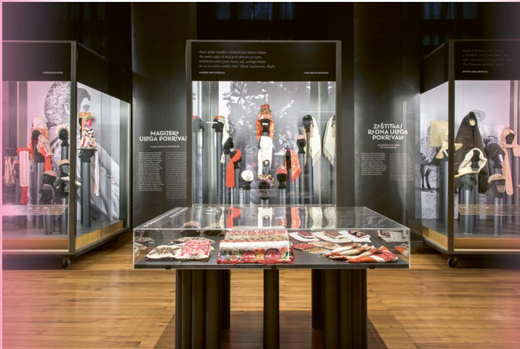
Sl. 2. – Dio izložbe „Kapa dalje:“ Priča o (ne)pokrivanju glave, 2019. (EMZ) / Fig. 2. – Part of the exhibition Hats off! A story about (un)covering the head , 2019, Ethnographic Museum in Zagreb, Croatia.