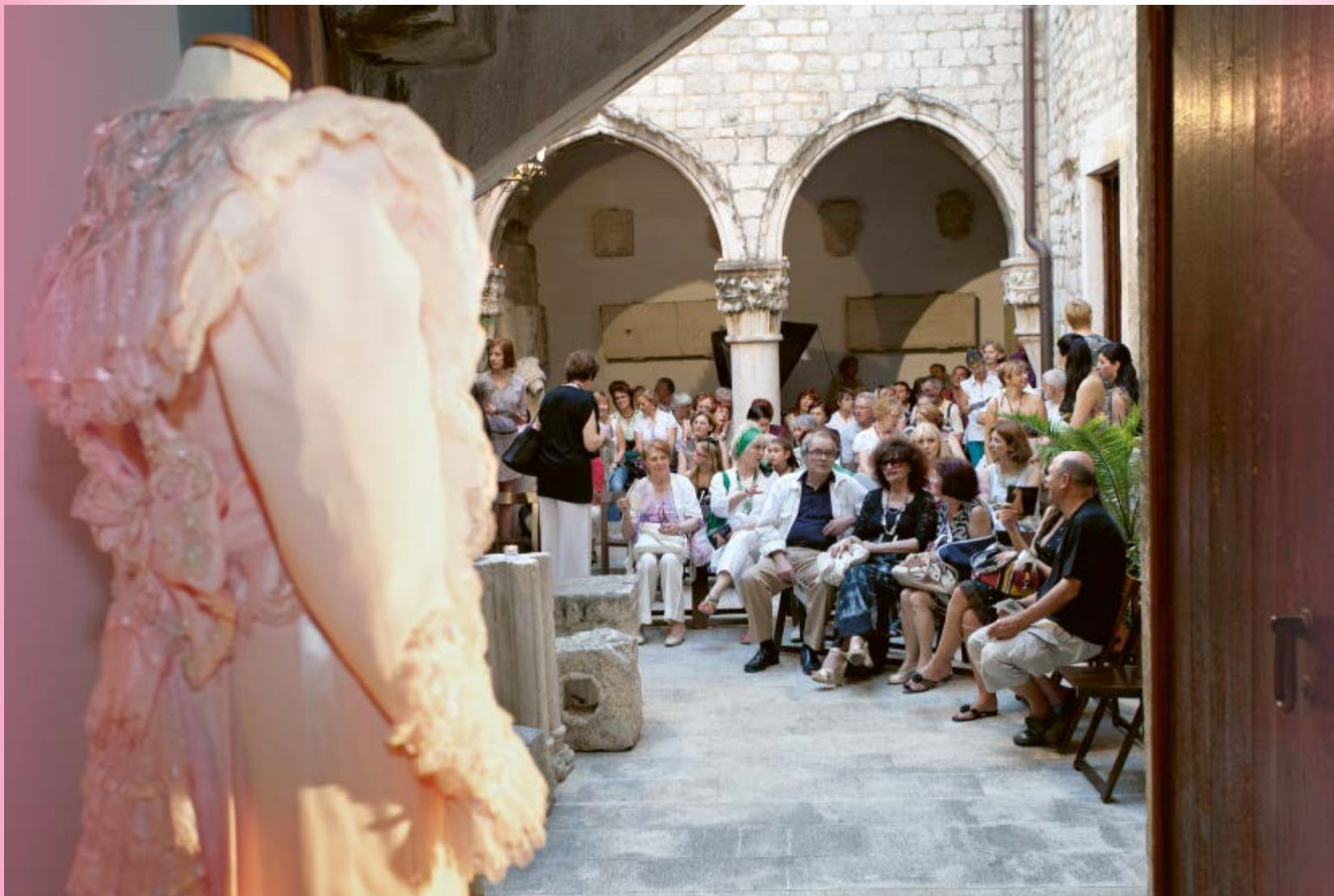
Sl. 2. – Presentacija donacije Starogradske splitske nošnje u Muzeju grada Splita 2011. godine, 2011. / Fig. 2. – Presentation of the donation of the "Traditional Costume from the Old Town of Split" to the Split City Museum, 2011.