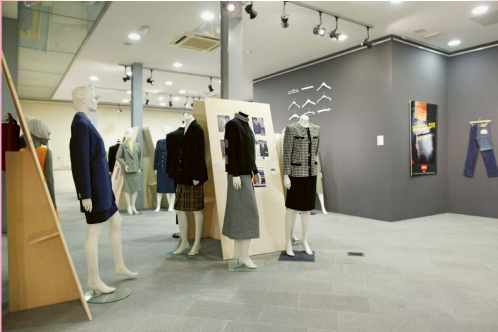
Sl. 4. – Postav izložbe Stojljeće tekstila u palači Herzer Gradskog muzeja Varaždin, 2018. / Fig. 4. – One Hundred Years of Textiles (Stojljeće tekstila) exhibition held at the Herzer Palace of the Varaždin City Museum, 2018.