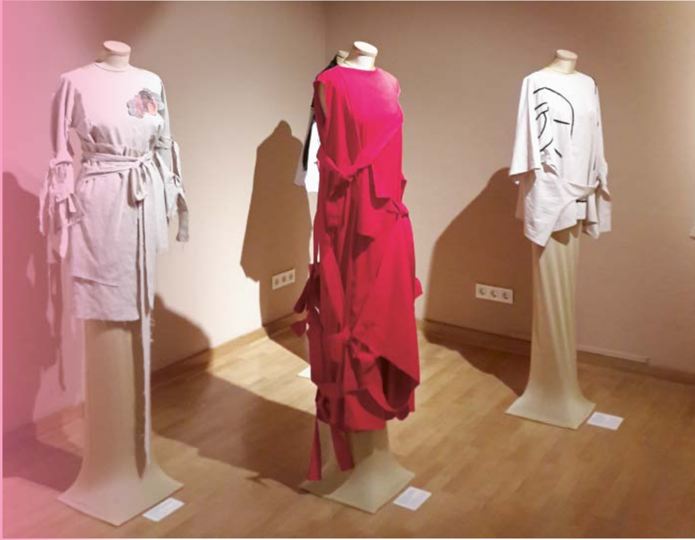
Sl. 7. – Odjevni dizajn nadahnut istraživanjem koptskog tekstila, rad studenata Zavoda za dizajn tekstila i odjeće, Naravoslovno-tehniške Fakultete, Sveučilišta u Ljubljani. Izložba KOPTI.TEX, Narodni muzej Slovenije / National Museum of Slovenia, 10. 10. 2019. – 21. 6. 2020. / Fig. 7 – Clothes designed and made by students of the Chair of Textile and Fashion Design at the Faculty of Natural Sciences and Engineering, University of Ljubljana, based on their study of Coptic textiles. Exhibition KOPTI.TEX, Narodni muzej Slovenije / National Museum of Slovenia, 10. 10. 2019. – 21. 6. 2020.