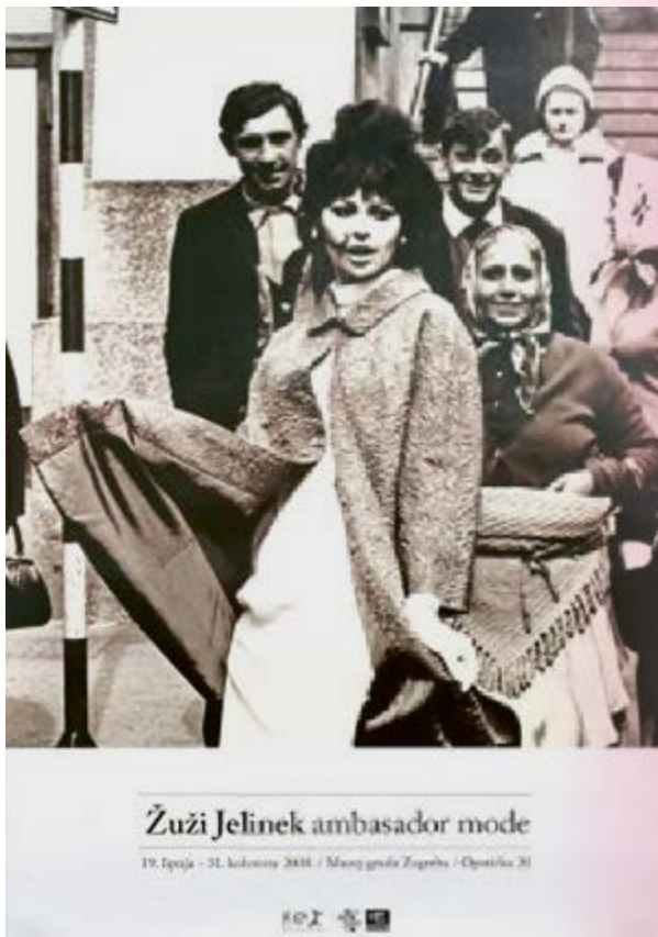
Sl. 2. – Plakat za izložbu Žuži Jelinek—ambasador mode , Muzej grada Zagreba, 2008. / Fig. 2 – Poster for the exhibition Žuži Jelinek—fashion ambassador , Zagreb City Museum, 2008.