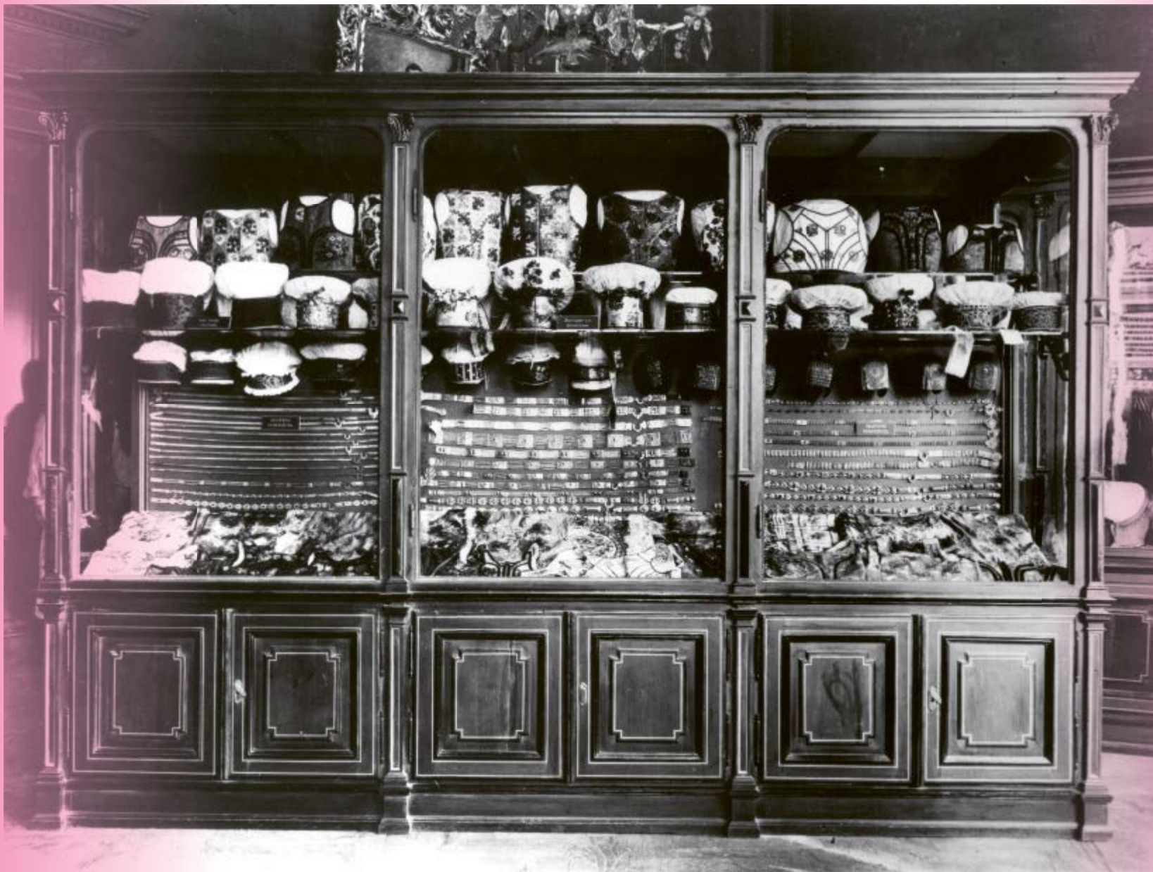
Sl. 2. – Vitrina s predmetima narodne nošnje u Kranjskem deželnem muzeju (između 1910. i 1920. godine). / Fig. 2 – Showcase with items of Folk Costumes in Provincial Museum of Carniola (between 1910 and 1920).