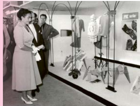
Sl. 5. – Drugarica Jovanka Broz u poseti Zagrebačkom velesajmu i izložbi „Porodica i domaćinstvo“, Zagreb, 06. 09.1958. / Fig. 5. – Comrade Jovanka Broz visiting the Zagreb Fairgrounds and exhibition “Family and household”. Zagreb, September 06th 1958.