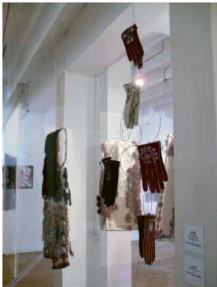
Sl. 1. – Izložba „Zubun. Kolekcija Etnografskog muzeja u Beogradu iz XIX i prve polovine XX veka“, autor M. Menković, rukavice Evice Milovanov–Penezić, Srpski kulturni centar u Parizu, 2010. (Etnografski muzej u Beogradu) / Fig. 1. – Exhibition “Zubun. Collection of the Ethnographic Museum in Belgrade from 19th and the first half of 20th century”, author: M. Menković, gloves created by Evica Milovanov–Penezić, Serbian Cultural Center in Paris, 2010. (The Ethnographic Museum in Belgrade).