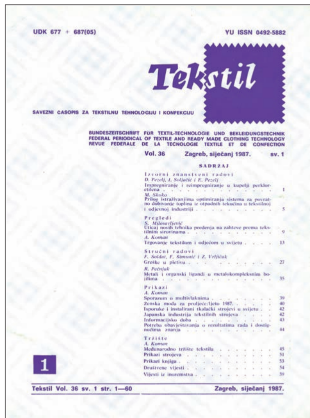
Fig. 2. The front page of the journal Tekstil first issue in 1987 in the new larger format

The scientific character of the journal Tekstil also reflects through the new journal format introduced in 1987. With the development of textile technology, there was a growing need for more detailed display of complex images that could not be adequately displayed in the earlier small format. The large format also had an economic background because of the representativity of the ads them selves. This format has been preserved to this day. The first issue of 1987 is shown in figure 2.