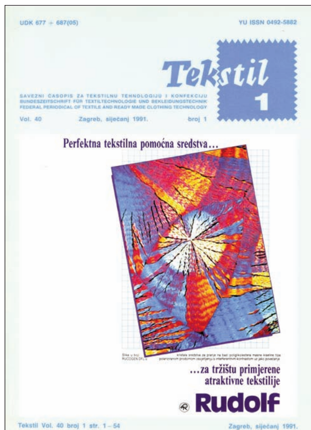
Fig. 3. First front page with advertisement, Vol. 40 (1991) Issue 1

Due to lack of adequate handbooks, editorial board published articles showing the basics of technological processes, the state of certain technologies and the like. Editorial board introduced translations of foreign professional and scientific papers in their own assessment but also in cooperation with foreign authors and manufacturers of machines and dyes. In