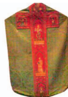
Fig. 10 Chasuble, 15 th century embroidery

Lucera by Bishop Mikulić, and had a spirit of Western European Gothic style. Fabric is linen with flatbed gold embroidery, aimed to achieve the illusion of deep space with different directions of points, so-called fish bones and partial use of silver thread.