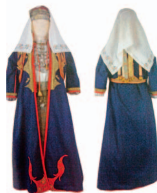
Fig.5 Bride Dinaric costume, Ošilje, mid-19 th century

In the lowlands of Croatia, peasants were wealthier than the rest of their compatriots, so they expressed their well-being in clothes. Costumes consisted of a large number of sets for special occasions, abundantly decorated with weaving and embroidery, and especially beautifully by embroidery with gold wire. Holiday shirts of women's Pannonia costumes were decorated in the chest area and on the sleeves with rich gold embroidery. Gold embroidered shirts were aligned with other clothing parts, apron, neck scarf and pommel, which are also decorated with golden embroidery. It is interesting that men wore plush sandals on the feet which were also embroidered with gold.