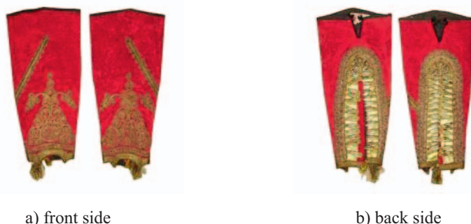
Fig.3 Men's knee socks, Popovici, Konavle, in 1957.

monly found on the vests, and the decoration was made in a technique called "tersian embroidery". Wedding costume contains two vests and both are decorated with metal threads.