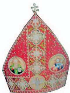
Fig.15 Miter, 1877, the Sisters of Charity