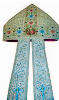
Fig.16 Miter around 1900 the Sisters of Charity

A large number of embroidery from church attire treasury of the monastery, go in order to achieve high quality, which is becoming a tradition, and is expanding to other convents [16].