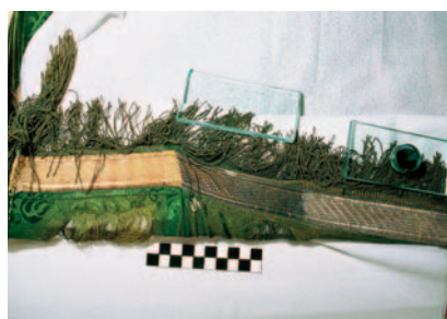
Fig.26 Detail of ribbon with gilded silver threads and metal threads, before the restoration.

Folk costumes were not found in Conservation Center, and we already know how this part of the Croatia