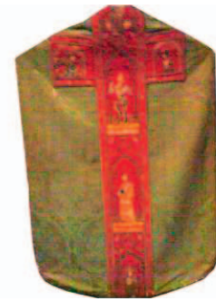
Fig. 10 Chasuble, 15 th century embroidery

Lucera by Bishop Mikulić, and had a spirit of Western European Gothic style. Fabric is linen with flatbed gold embroidery, aimed to achieve the illusion of deep space with different directions of points, so-called fish bones and partial use of silver thread.