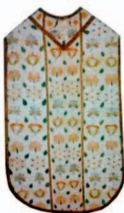
Fig.18 Chasuble, first half 17 th century (Photos from the liturgical vestments of the textile collection, Museum of Arts and Crafts)

In the 15 th and 16 th century dominated chasuble from Italy, while some are from Austria and Germany. Croatian chasubles are not present at the Museum of Arts and Crafts. Chasubles from the first half of the 17 th century are assumed to be Croatian origin, and their common characteristic is that they are modest in the selection of materials and simple in design as well as in embroidered decorative motifs.