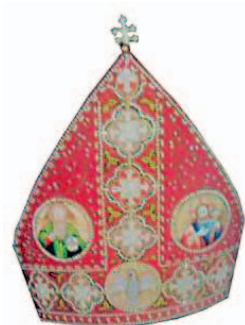
Fig.15 Miter, 1877, the Sisters of Charity