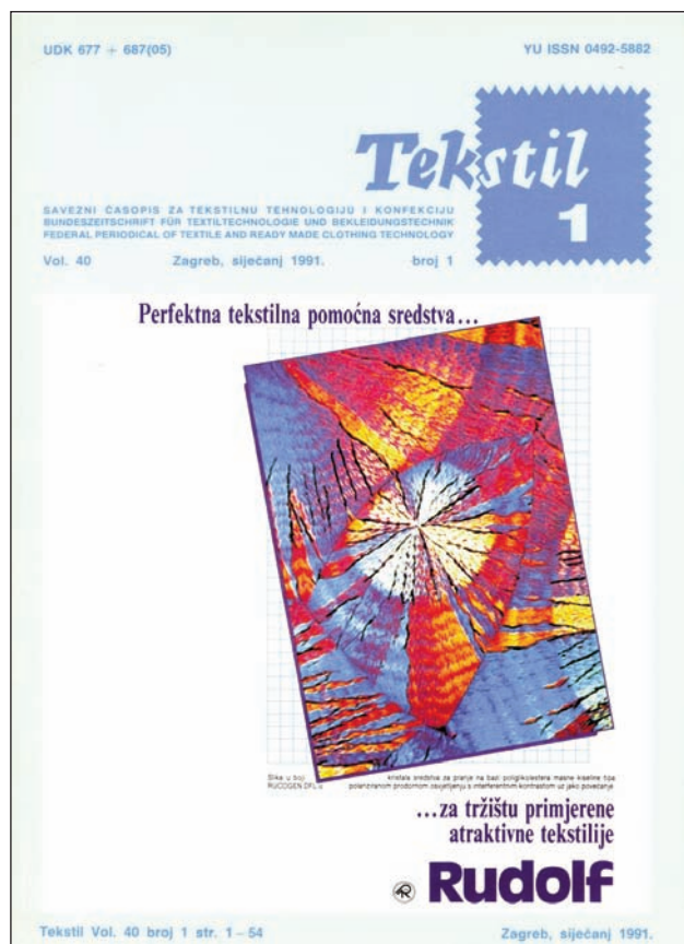
Fig. 3. First front page wit advertisement, Vol. 40 (1991) Issue 1

Due to lack of adequate handbooks, editorial board published articles showing the basics of technological processes, the state of certain technologies and the like. Editorial board introduced translations of foreign professional and scientific papers in their own assessment but also in cooperation with foreign authors and manufacturers of machines and dyes. In