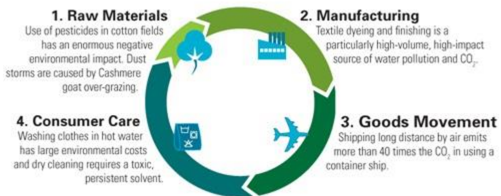
Figure 1. Life cycle of pollution [12]

ovens and boilers and preparation, combing, carding and fabrics manufacturing. In addition to the pollution of water, soil and air, textile industry produces large amounts of solid waste, which is not necessarily hazardous. These include textile waste scraps of fabric and yarn, packaging waste, paper, cardboard, plastic packaging; dyes and chemical containers as well as general domestic waste. Frequent replacement of textiles caused by constant changes in fashion imposes a need for recycling, reusing and proper disposal of textile waste [11].