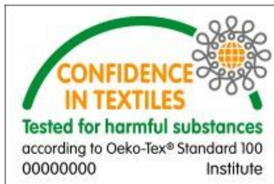
Figure 5. OEKO-TEX® logo [32]

Textile Research Institute (Österreichisches Textil-Forschungsinstitut, O.T.I.) and Hohenstein Institute (Forschungsinstitut Hohenstein, F.I.H.) based on a nine-year research in O.T.I. led by Professor Herzog. OEKO-TEX deals directly with humane textile ecology, testing and assessment of possible hazards of textile products for human health. The Standard 100 by OEKO-TEX gives the textile and clothing industry uniform guidance for the potential harm of substances in raw materials as well as finished products and every stage in between—these include regulated substances as well as substances that are believed to be harmful to health, but are not yet regulated. The standard also governs elements such as colorfastness and pH value [31]. Labeled products range from products underlying high standards as textiles for babies and underwear to products which have to meet less strict requirements as textiles for decorative purposes such as wall and floor coverings.