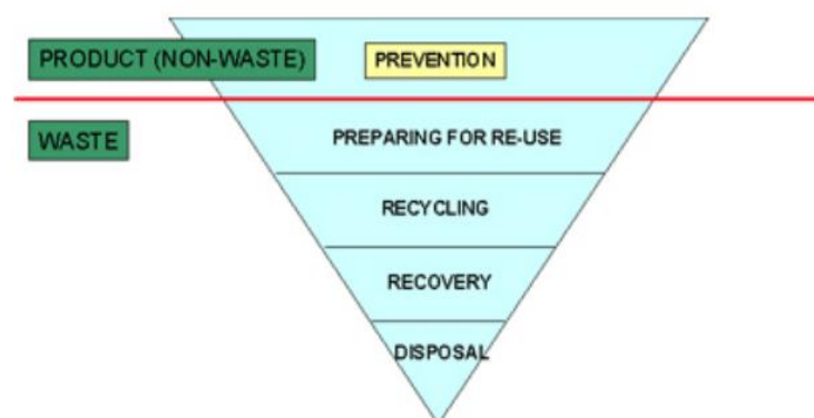
Figure 8. The EU Waste Management Hierarchy [39]

The EU nominated textiles as a priority waste stream and in December 2008, the EU legislated on textile recycling in the form of a revised Waste Framework Directive (WFD). The Directive 2008/98/EC, determines some basic waste management principles: it requires that waste needs to be managed without endangering human health and harming the environment, and in particular without risk to water, air, soil, plants or animals. EU Member States adopted waste management plans and waste prevention programs and applied these regulations by prioritizing them according to the following waste management hierarchy [38]: