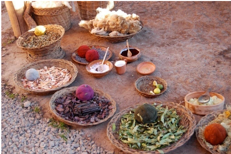
Figure 9. Natural dyes [49]

For example, Indigo is a skin, eye and respiratory system irritant so proper health and safety equipment must be applied when working with it. It is also possible that some pesticides, herbicides, etc., may have been used on the crop or perhaps the crop itself may have been genetically modified. Also, natural dyes require more energy in the dyeing process because they usually require high temperature baths for longer periods of time than the optimized synthetic dye. The amount of natural materials, such as plants, lichens, insects and minerals, needed to color the fabric is much greater than required by synthetic dye materials [46]. Ideal solution would be to use waste from various industries, such as food, forestry or agricultural activities for the production of natural dyes. The problem of environmental pollution would be reduced significantly and production cycle would be closed [48].