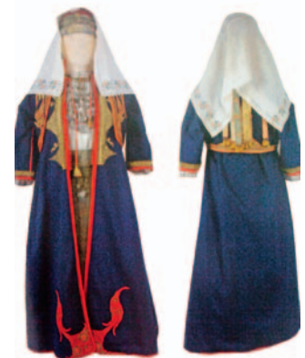
Fig.5 Bride Dinaric costume, Ošilje, mid-19 th century

In the lowlands of Croatia, peasants were wealthier than the rest of their compatriots, so they expressed their well-being in clothes. Costumes consisted of a large number of sets for special occasions, abundantly decorated with weaving and embroidery, and especially beautifully by embroidery with gold wire. Holiday shirts of women's Pannonia costumes were decorated in the chest area and on the sleeves with rich gold embroidery. Gold embroidered shirts were aligned with other clothing parts, apron, neck scarf and pommel, which are also decorated with golden embroidery. It is interesting that men wore plush sandals on the feet which were also embroidered with gold.