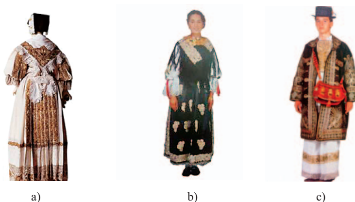
Fig.6 The most festive costumes: a) and b) the most festive female costume, Slavonia, c) the most solemn male costume, near Vinkovci

The most solemn female costumes in Đakovo, Vinkovci and Srijem were richly decorated with gold embroidery all over, as seen in Fig.6a and 6b. Men's costumes in Slavonia, as well as women, are characterized by a rich gold embroidery: it decorated the chest part of shirt, so called "prse", trousers, and a vest of black atlas. Gold and silver stripes called "gajtani" decorated a long coat of wool. Fig. 6a shows a female costume from the permanent exhibition of the Ethnographic Museum Zagreb, while Figs 6b and 6c are taken from the book of Croatian folk costumes.