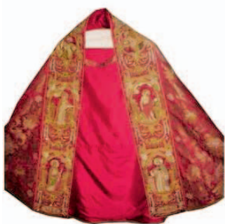
Fig.12 Cloak, Zagreb, 1663

gloves. Many of them are kept in the treasury of the Zagreb Cathedral.