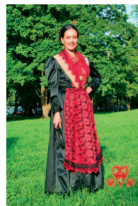
Fig.8 Varoška costume (Split)

After Christianity in the 4 th century became the official religion, conditions have been created for the development of special liturgical vestments, which consists of upper and lower garments. The interest of experts in the field of art in Textile focused mainly on outerwear especially on the chasuble, dalmatic, cloak, stole, miter or liturgical hat. From equipment of chalice stands out velum or cover for chalice, which is