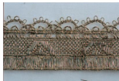
Fig.24 Detail of lace with silvered metal threads, after repair damage

Besides the chasuble, the most common liturgical vestments are surplices which have the edges decorated with twisted tassels, containing metal threads, while metal strips are embroidered into the fabric.