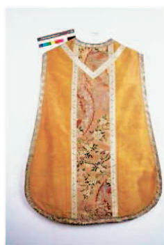
a) (photo: V. Vučković, 2005.)