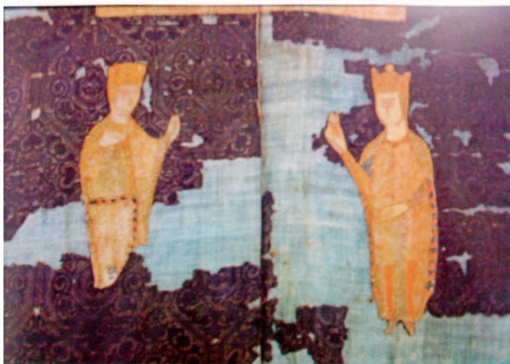
Fig.9 Ladislav mantle - chasuble (detail), 11 th century

The Treasury has no preserved items from 12 th and 13 th century. Humeral, so called "naramenik", of a Bishop Augustin Kažotić, originated from France or Italy from around 1300. Sometimes was dressed on chasuble, and was richly decorated. Today humerals are made of canvas without decorations, and are carried under alba. It was passed to Zagreb from