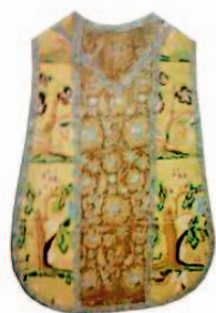
Fig.21 Chasuble, embroidery from the Croatian beginning of the 18 th century

For example, very abundant embroidery for the chasuble from the Croatia, fabric is silk damask with lace motifs in relief and flat silver embroidery, produced by nurses from Benedictine monastery in Rijeka. As well as the cover for the chalice from 1725 which have relief and flat gold embroidery on white silk taffeta, shown in Fig.20.