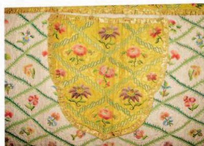
Fig.13 Part of dalmatics, Vienna 1775

The 1775 empress Maria Theresa granted Treasury precious cloth intended for her festive dresses, and built by her court ladies. Conventual ornat contains cloak, chasuble and dalmatic. From gold metal stripes are derived on pluvial longitudinal stripes and cocoons, on the chasuble central vertical surfaces, and on the dalmatic central squares. Every part of the ornat has at the bottom back of silver film, applied, gold-embroidered re-