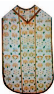
Fig.18 Chasuble, first half 17 th century

In the 15 th and 16 th century dominated chasuble from Italy, while some are from Austria and Germany. Croatian chasubles are not present at the Museum of Arts and Crafts. Chasubles from the first half of the 17 th century are assumed to be Croatian origin, and their common characteristic is that they are modest in the selection of materials and simple in design as well as in embroidered decorative motifs.