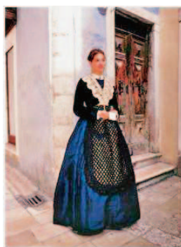
Fig.7 Festive folk costume, Zadar, 2 nd half of the 19 th century

Inner clothes of a costume consisted of a shirt and an underskirt. The upper part of the costume (plastron) is a yellowish tulle collar, richly embroidered with gold metal thread and silk, placed on the chest and neck, and buttoned with gilded buttons.