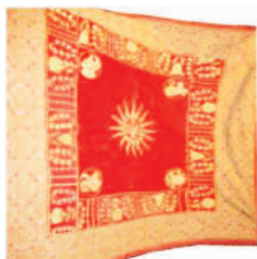
Fig.11 Cover from 16 th century

The workshop made textile items mainly for the Zagreb Cathedral, and left tremendous opus of wide stylistic range, from the late Renaissance and Mannerism to the Baroque innovation. Stoll was a teacher in Zagreb since the 1655 up to 1664 and was a specialist in figurative and ornamental, relief gold embroidery, all kinds of decorative applications, and pearl embroidery. To create expensive gold embroidery is necessary to have sufficient amount of a thin sheet metal of gold in order to produce a variety of treads for embroidery. Such as gold wire, spiral gold wire, gold strips and silk threads coated with gold stripes. His numerous works can be counted among the top embroidery European achievements. His preserved works in Zagreb consists of 7 antependium, "God grave" from the 1659, 7 cloaks, 1 chasuble, 2 miters and 1 pair of