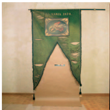
a) (photo: N.Vasić, 2006.)