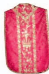
Fig.14 Chasuble, Croatia late 18 th century, (photo K.Šimić)

Fig. 16 shows the white miter, another work of the Sisters of Mercy around 1900. The material is white silk, with gold and multicolored silk embroidery.