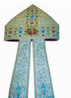
Fig.16 Miter around 1900 the Sisters of Charity

A large number of embroidery from church attire treasury of the monastery, go in order to achieve high quality, which is becoming a tradition, and is expanding to other convents [16].