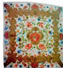
Fig.20 Cover for the chalice, Croatia, 1725 Benedictine monastery of Rijeka

The second half of the 19 th century is characterized by works of embroidery workshops Wolfgang Jakob Stoll in Zagreb. Cloak from the embroidery workshops Stoll is made with “arab” stitch on a white silk background and gold embroidery, Fig. 19 shows a detail of the cloak. Bottom bordure of cloak is composed of two rows of stylized plant motifs surrounded by golden threads. Cloak was in 1899 purchased from merchant Schotten in Zagreb, and restoration was carried out 1975 since the cloak was in very poor conditions. In the 18 th and 19 th century dominated chasubles from France, and there are fewer from the Croatia. Those are some embroidery for chasuble from the early 18 th century which has silver and gold embroidery.