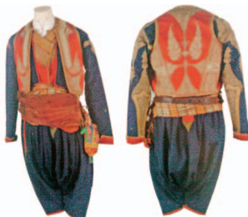
Fig.2 Men's festive costume, Dubrovnik coast, late 19 th century