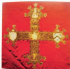
Fig.17 Embroidery, end of the 14 th century, Croatia (Photo from the liturgical vestments of the textile collection)

The old museum inventory states that the cross came from Zadar, family Gavalla. The cross was originally at a high damaged background of red