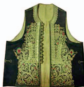
Fig.4 Women's vest with "tersian" embroidery, Jačerma" Konavle, 19 th century

Pannonian costumes differ from each other because of the large area they occurred over, and depending on the