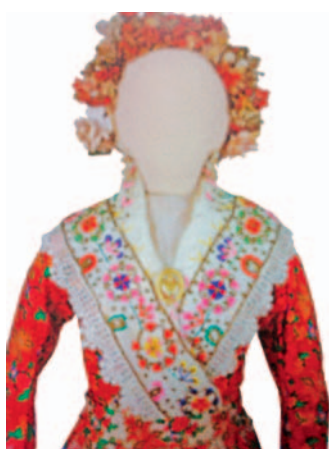
Fig.1 Bride costume, Adriatic type, Dubrovnik coast, beg. 20 th century

On the most festive occasions, leather belts were placed around the waist that had several partitions, and were used to store a variety of items such as knives, bags for tobacco or for money [9]. Men's costumes have multiple applications of metal threads: on the pants, vest and jacket. Metal silver and gold threads are most com-