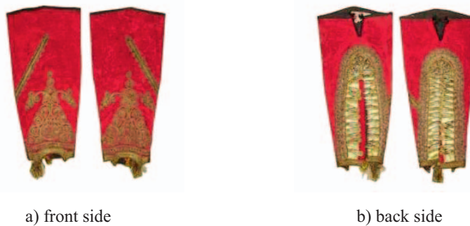
Fig.3 Men's knee socks, Popovici, Konavle, in 1957.

monly found on the vests, and the decoration was made in a technique called "tersian embroidery". Wedding costume contains two vests and both are decorated with metal threads. Metal threads are applied on the Adriatic costumes also as an integral part of men's socks: these are found in the Ethnographic Museum "Rupe", in Dubrovnik and Zagreb Ethnographic Museum where they were photographed and shown in Fig.3.