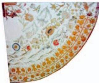
Fig.19 Cloak (detail), Zagreb, second half 17 th century, Stoll embroidery workshop

Decorative embroidery is on a white linen cloth, in several pastel shades, embroidered with so called “arab” stitch. Some of these chasubles contain the gilded ribbons, gold wire or gold-plated tiny metal rings, as well as the gold embroidery.