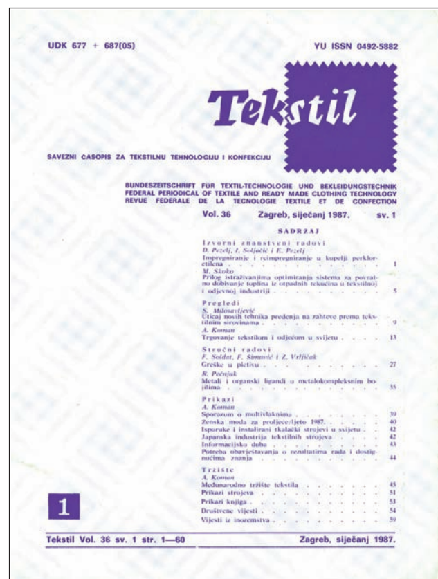
Fig. 2. The front page of the journal Tekstil first issue in 1987 in the new larger format

The scientific character of the journal Tekstil also reflects through the new journal format introduced in 1987. With the development of textile technology, there was a growing need for more detailed display of complex images that could not be adequately displayed in the earlier small format. The large format also had an economic background because of the representativity of the ads them selves. This format has been preserved to this day. The first issue of 1987 is shown in figure 2.